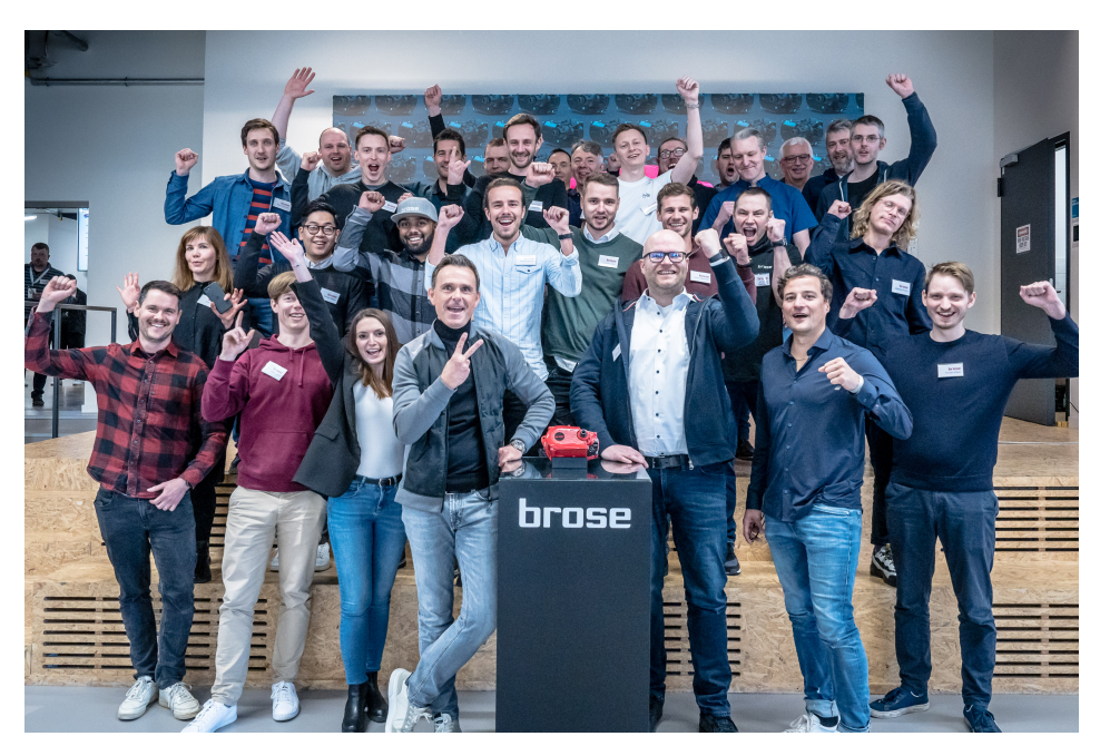
The Brose team is delighted with the great success.

motors focuses on more performance despite its more compact dimensions, while the other's continuously variable automatic transmission allows new design freedom for bicycle manufacturers and shift-free riding pleasure for end customers.