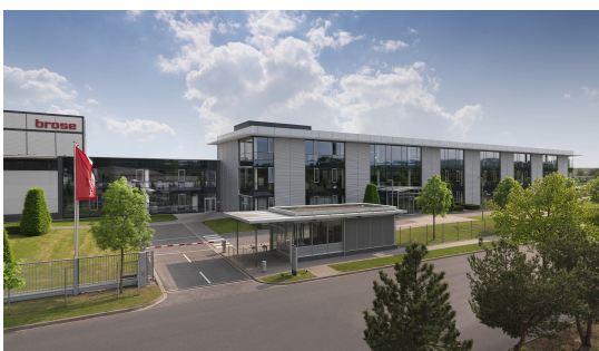
Brose has continuously expanded its Hallstadt location since 1990.

As an international family-owned company, Brose is committed to social responsibility in Hallstadt. The automotive supplier supports professional sports as the title sponsor of the seven-time German basketball champions – the Brose Baskets; the Brose Arena is also named after the company. The mechatronics specialist has supported the Bamberg Symphony since 2006. And Brose employees are active in a partnership program to help integrate young refugees.