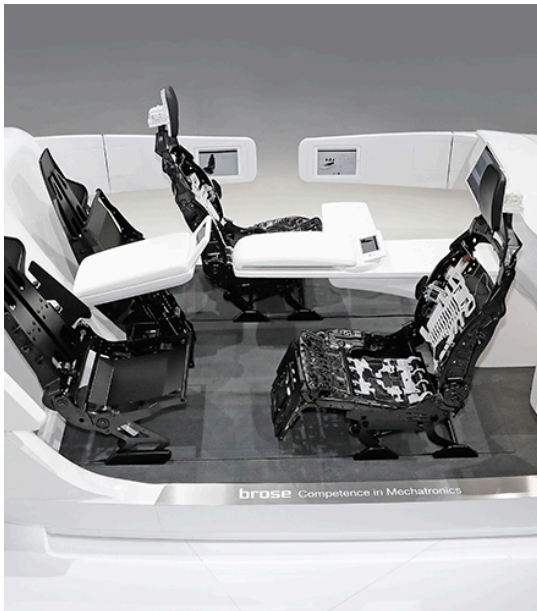
The adjustment technology for flexible interior usage is developed in Coburg.