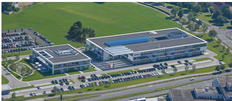
Planning for the next stage of expansion at the Berliner Ring site in Bamberg begins in 2018.