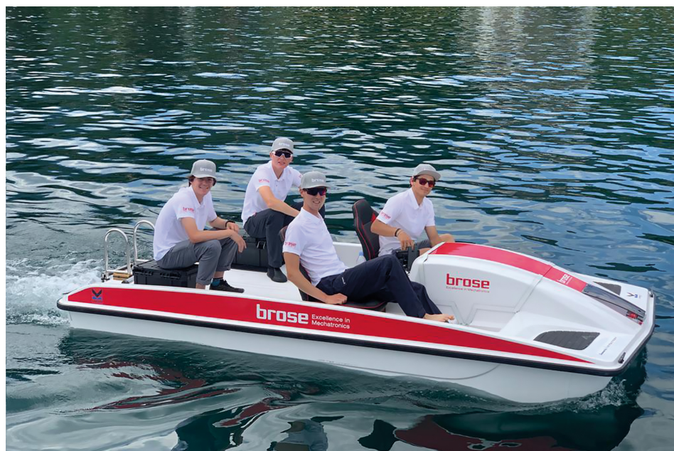
As in the car race, the four young men took turns.