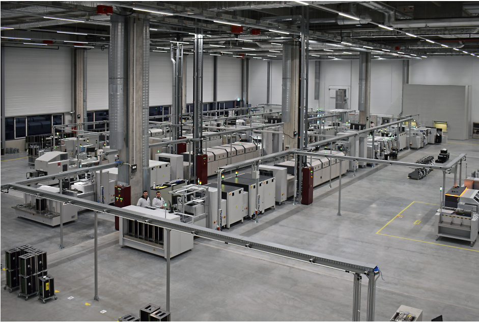
Brose is investing in state-of-the-art electronics manufacturing in Belgrade/Serbia.