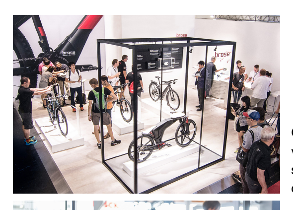
Great interest: around 8,000 people visited the Brose stand at the Eurobike show to learn about the company's latest developments.