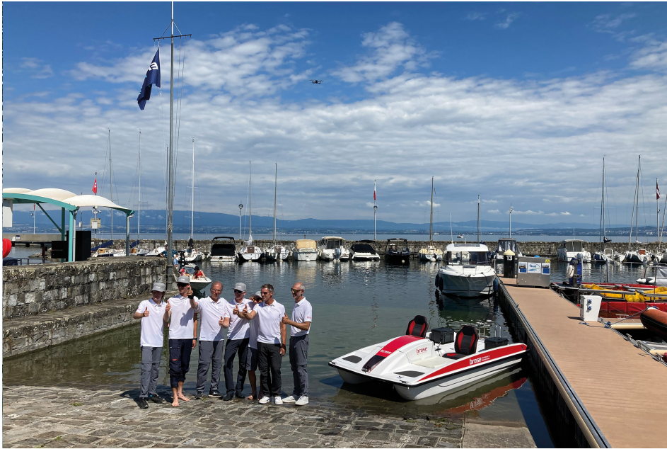
Record achieved! The crew and their boat after 24 hours