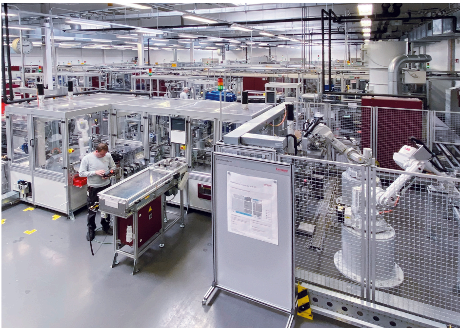
The electric climate compressor is manufactured at Brose's locations in Würzburg/Germany (picture) and Taicang/China.