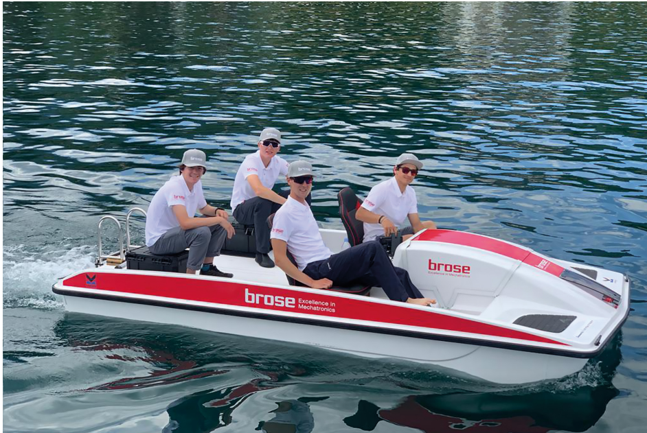
As in the car race, the four young men took turns.