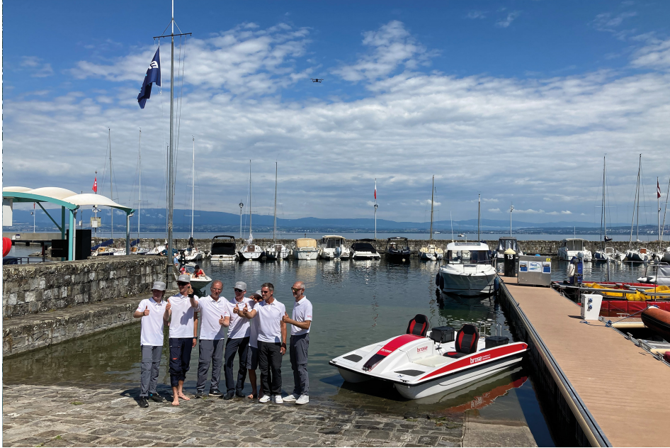
Record achieved! The crew and their boat after 24 hours