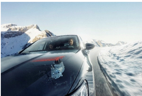
The automotive supplier's system for efficient climate control increases the range of electric vehicles.

The Chinese government's "Dual Carbon" target has resulted in a greater focus on environmental protection. Above all, it is driving the trend towards electrification in the automotive industry. Brose also brought solutions for this to Shanghai and is presenting an integrated system for thermal management that actively controls the distribution of heat inside the vehicle. The system significantly increases the range of electric cars – without compromising on comfort. The new electric climate compressor with an operational voltage of 810 volts also shortens charging time to less than 30 minutes.