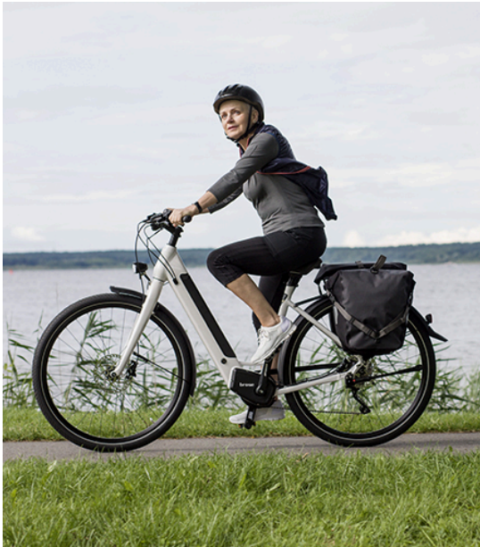
Drive T ist he sporty allrounder of the Brose Drive product family.