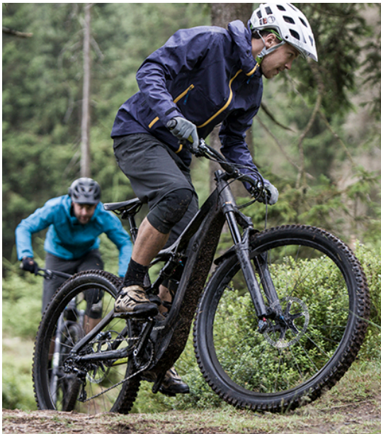
Brose Drive S: Consistently powerful performance even on the most demanding trails.