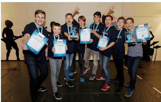
Winner of the regional competition in Würzburg: Team RS KnightMar from Realschule Marktheidenfeld.

Over 32,000 teams in 88 countries participate in the educational program. The non-profit organization “HANDS on TECHNOLOGY” is responsible for the tournament showcasing robots and ideas in Germany, Austria, Switzerland, the Czech Republic, Hungary, Poland and Slovakia. More than 7,000 boys and girls in 900 teams registered for the First Lego League in these countries.