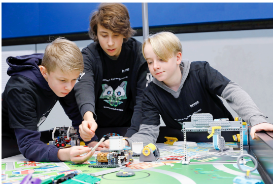
The robots of the student teams had two and a half minutes to complete as many of the 18 tasks as possible.