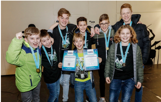
The runner-up MLRobotS from Main-Limes-Realschule Obernburg also qualified for the state finals.