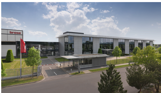
Brose has continuously expanded its Hallstadt location since 1990.

As an international family-owned company, Brose is committed to social responsibility in Hallstadt. The automotive supplier supports professional sports as the title sponsor of the seven-time German basketball champions – the Brose Baskets; the Brose Arena is also named after the company. The mechatronics specialist has supported the Bamberg Symphony since 2006. And Brose employees are active in a partnership program to help integrate young refugees.