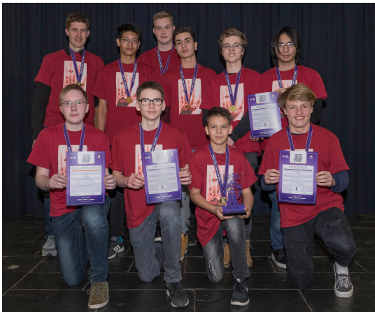
Winner of the regional competition of the First Lego League: The team X-Rays@M! IND-Center of the Röntgen-Gymnasium in Würzburg.