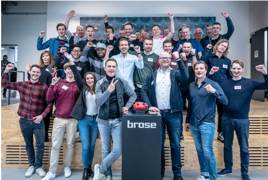
The Brose team is delighted with the great success.

other's continuously variable automatic transmission allows new design freedom for bicycle manufacturers and shift-free riding pleasure for end customers.