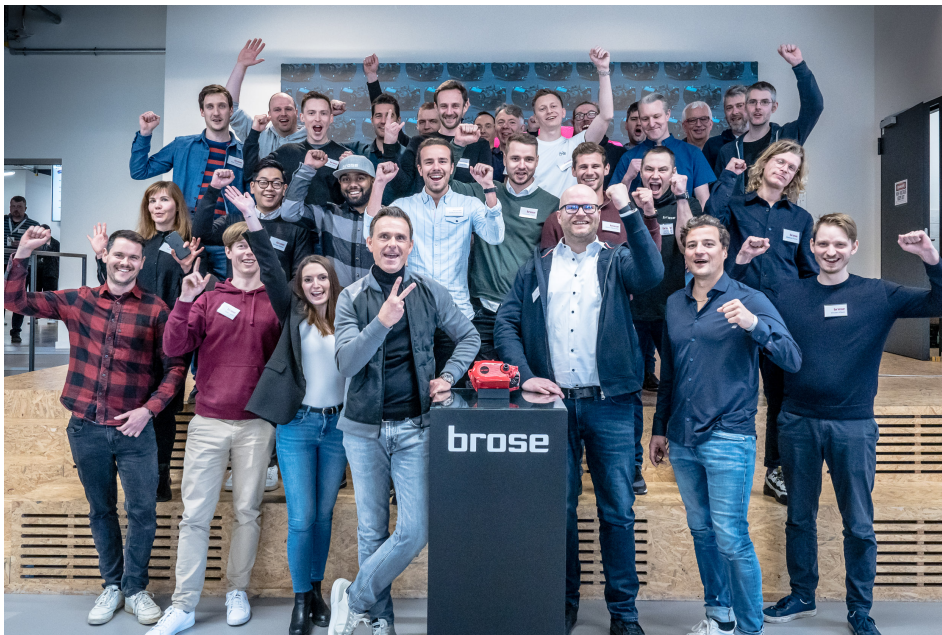
The Brose team is delighted with the great success.

other's continuously variable automatic transmission allows new design freedom for bicycle manufacturers and shift-free riding pleasure for end customers.