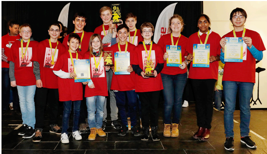
The X-Rays from the Röntgen-Gymnasium Würzburg are the champions of this year's regional competition of the First Lego League.