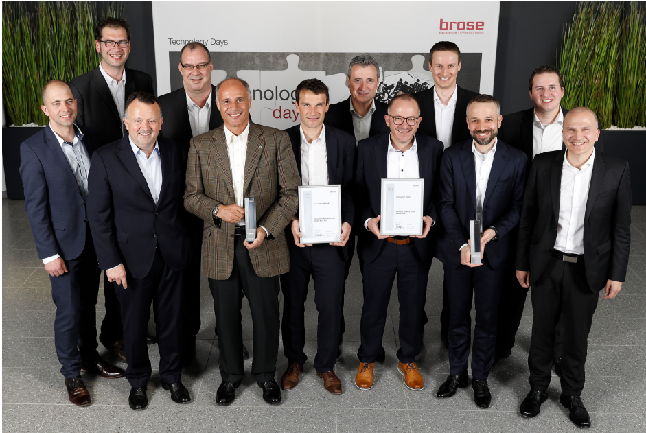
Recognized for jointly developed innovative production technology: The Bihler and Schürholz companies received the Brose Supplier Innovation Award.